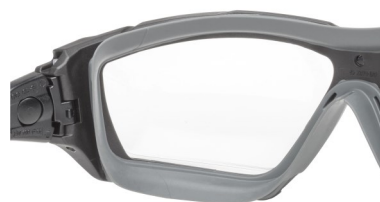
Ample, flat TPE Flange comfortably wraps around the eye socket for comfort and protection.