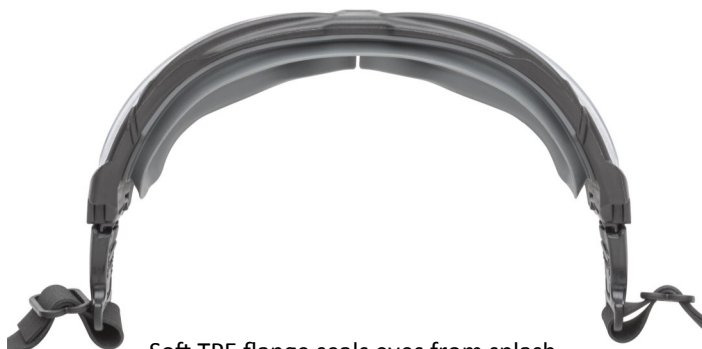
Soft TPE flange seals eyes from splash and mists.